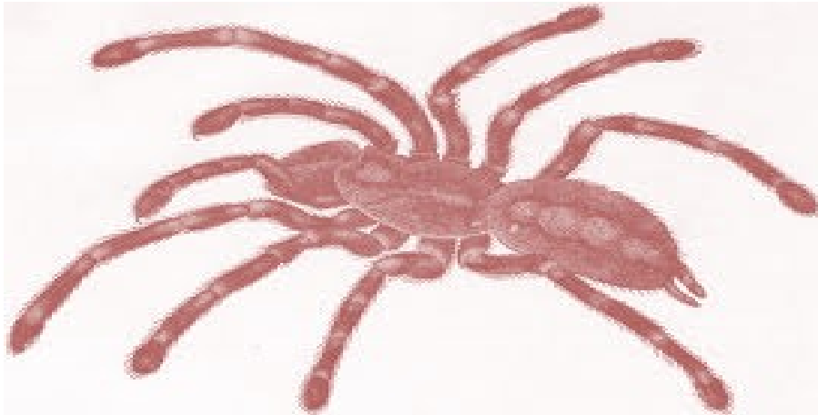
The Giant Bird Eating Spider

When you read, you can use what you already know to learn more. We can use 'KWL Charts' to help us organize our thinking about the topic.